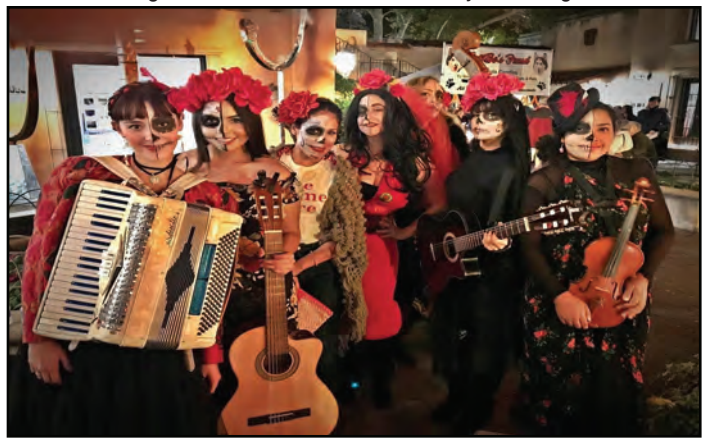
HALLOWEEN doesn't come in February - but costumed Las Chollas Peligrosas all-female band will take Tempe's Hayden's Ferry Days February 24 Festival, as a substitute. Peligrosas means "dangerous women" so in addition to performing traditional Mexican music, expect a little "getting in your face" about social

'tent' throughout the afternoon - - - you could do that while enjoying a free serving of ice cream, courtesy of the Tempe Historical Society which is marking its own 50th Anniversary in this new year of 2019 and wants you to join them in celebrating it. THS and the Museum hope you will also join them in celebrating the double birthdays" at other Hayden's Ferry Days activities dotting the 2019 calendar from February 22 through March 16