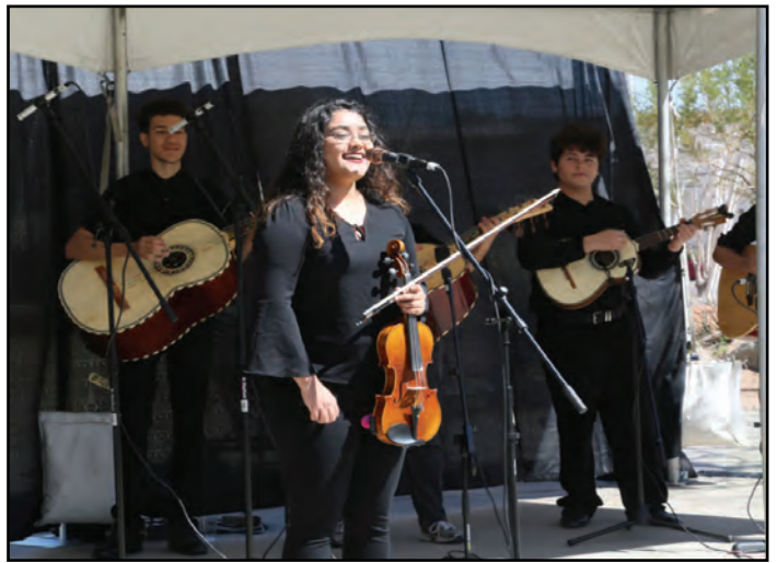
YOUTH GROUPS are always a big part of the entertainment at the Historical Society's annual Hayden's Ferry Days festival and this year will be no exception. Among the younger performers will be the Mariachi group above and - (guaranteed to create a BIG sound) - a large group of young steel drummers.

But maybe you might just want to sit down, relax, watch the crowd and listen to the assorted music makers who will be performing "under the